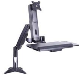
Click on the thumbnail for a larger image: